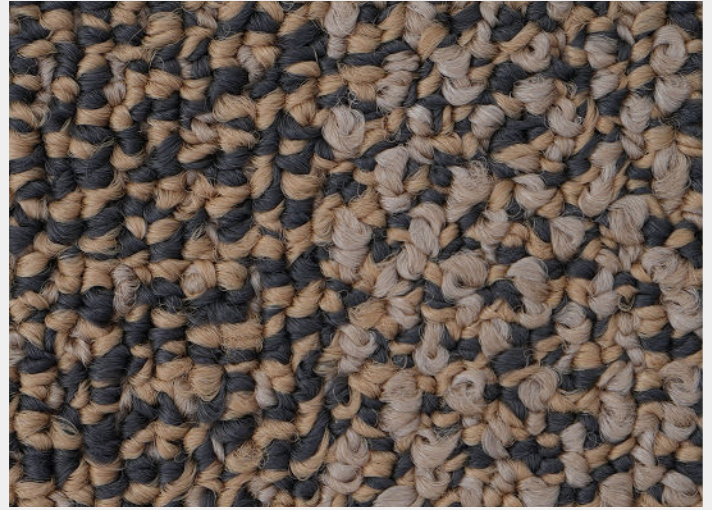
SY - BEIGE