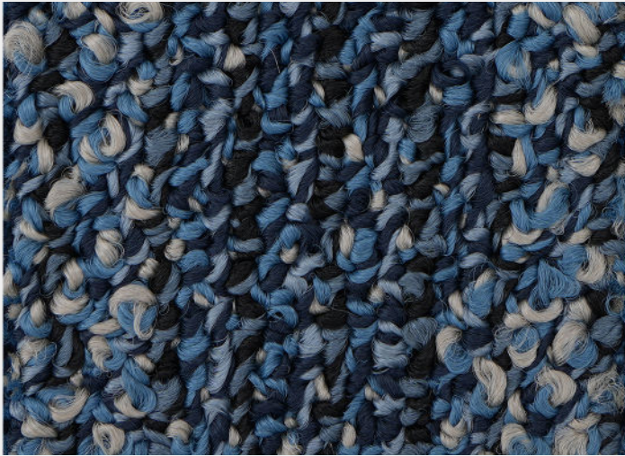
SY - BLUE