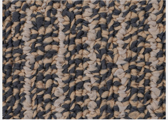
MP - BEIGE