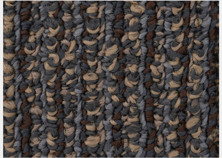
MP - BROWN