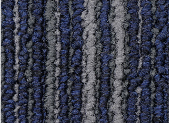
C5.03 - CATALAN BLUE