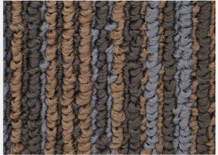
C5.04 - CORAL