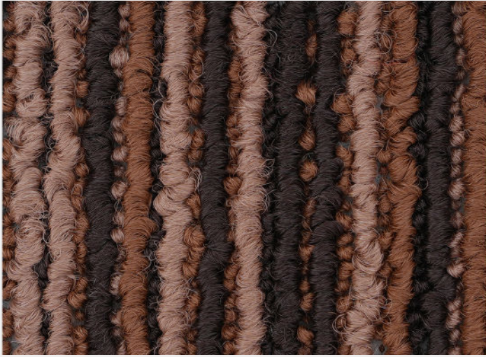
C5.01 - CINNAMON