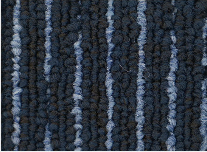
C6.501 - BLUE