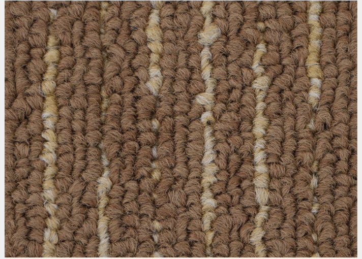
C6.504 - BEIGE